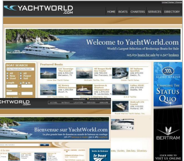
YachtWorld US, YachtWorld France

Don't forget about YachtWorld's global reach . In a single buy, your campaign can be placed on all 14 of our country sites: US, UK, France, Italy, Spain, Germany, the Netherlands, Sweden, Denmark, Norway, Finland, Australia, the Russian Federation, and UAE.